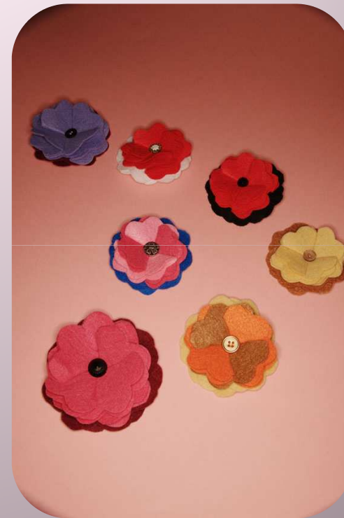
Medium size broaches measuring roughly 7 cm in width.

They can be used as broaches or as hair accessories.