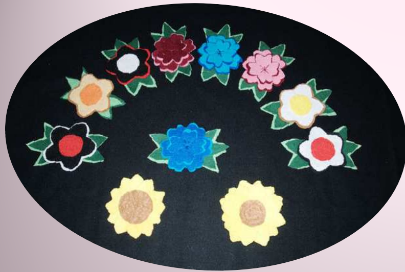
Larger broaches measuring 9cm in width and 4cm in height.